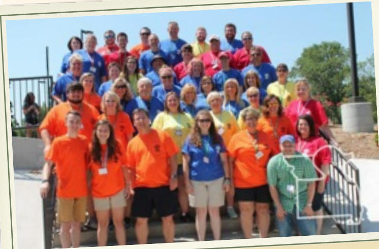
STUCO ADVISOR - BEST JOB IN THE WORLD

Week long leadership training, full of hands on, active, and high-energy learning opportunities. Includes: problem solving, project planning, self-esteem, team-building, large and small group activities.